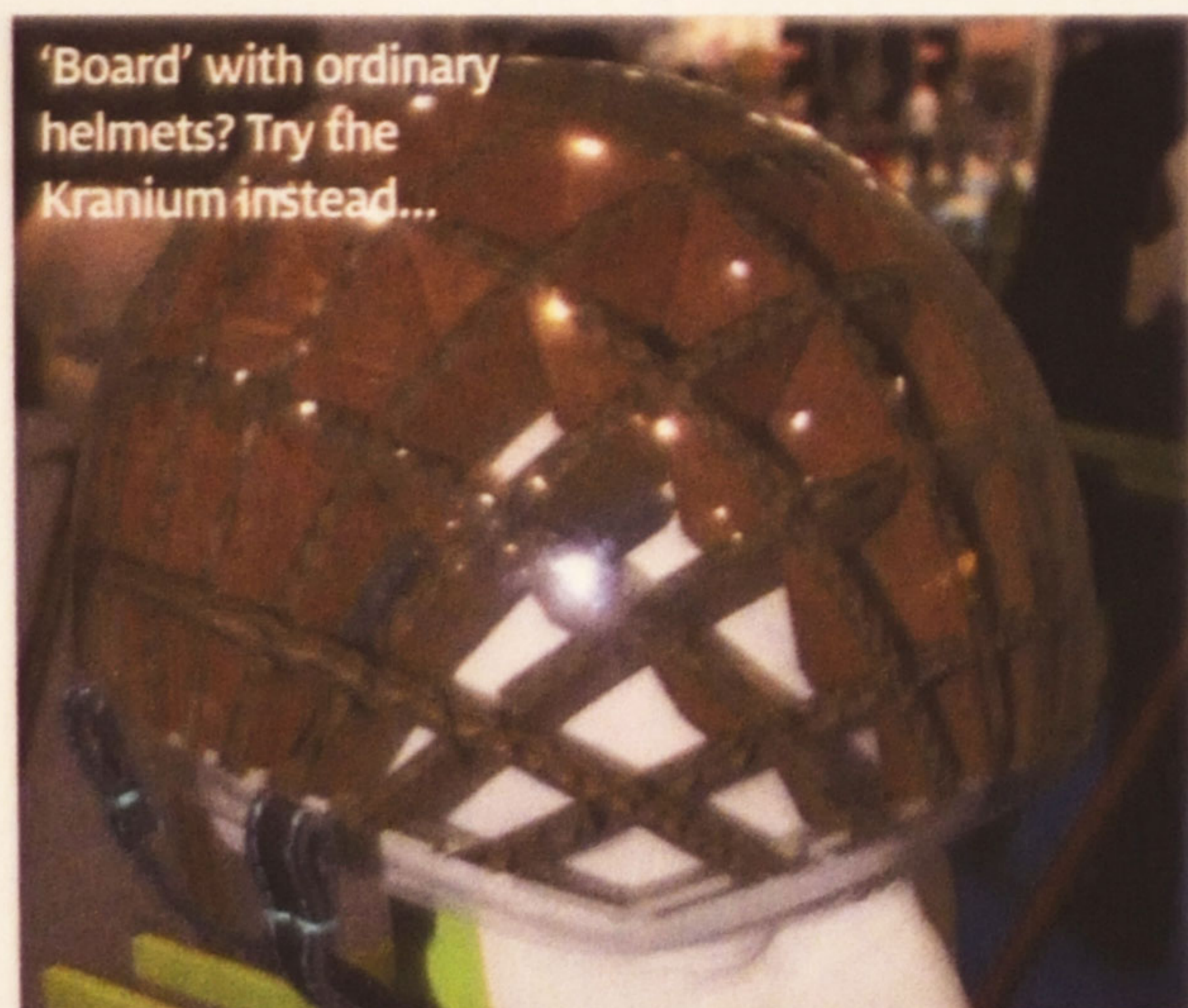
'Board' with ordinary helmets? Try the Kranium instead...

For more information on the Kranium see www.anirudharao.com